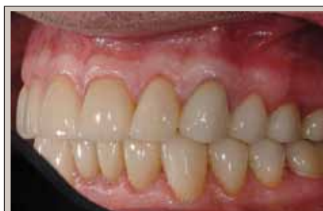
Figure 17: Lateral view of the restored occlusal plane shows the distinct cuspal form, which allows for precise occlusal contact.