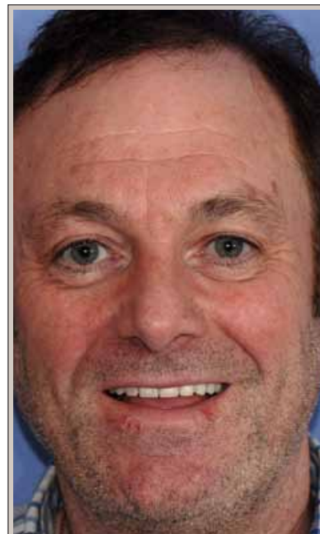
Figure 18: The posttreatment smile reveals the patient is satisfied with the esthetics of his new “English smile.”

controlling the gastric reflux and placing indirect restorations, the risk has been reduced to moderate, and the prognosis is fair. Functional risk continues to be moderate. The creation of a stable and repeatable P2 “home” position with appropriate guidance lessened this patient’s risk of future functional problems and improved his functional prognosis. However, due to his history, he cannot be classified as low risk.