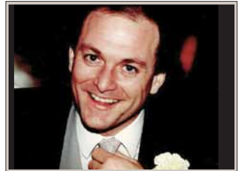
Figure 2: A photograph taken 12 years ago shows normal tooth length. The photograph suggested that tooth wear was a relatively recent event.