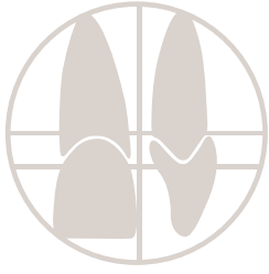
Table of Contents VOLUME 1, NUMBER 4