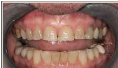
Figure 5: The labial enamel was reduced in thickness, almost exposing dentin in some areas.