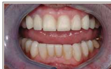
Figure 10: During a four-week trial period, the new occlusal pattern was successfully tested with the provisional restorations. The esthetics of the reconstruction also were finalized and approved over this period.