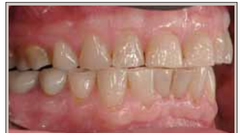
Figure 6: Lateral view of an occlusal plane worn flat, with little or no cuspal form remaining.