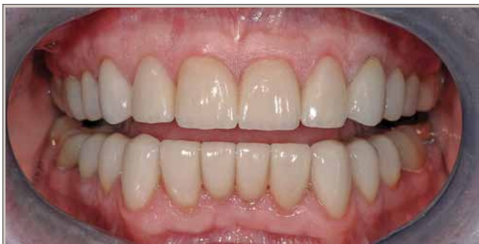
Figure 13: The restoration of the teeth involved a combination of cohesively retained porcelain crowns and adhesively retained porcelain restorations. The biomechanical requirements of each tooth dictated the type of restoration that would best serve the patient's interest.

At this follow-up appointment, all 20 indirect restorations were definitively occlusally refined in CR to establish the correct intercuspal “home” position (P2) using Shimstock and thin articulating paper. The guidance, or “pathway” (P3) was evaluated using 200- \mu m horseshoe paper. The paper