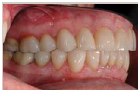
Figure 16: The restored occlusal plane was rebuilt in harmony with dentofacial parameters and functional requirements.

Periodontal risk remains low, with good prognosis. Biomechanical risk was initially high with a hopeless prognosis. By