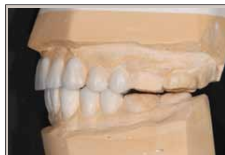
Figure 8: In order to lengthen the incisors, the posterior segments were built up to maintain overall occlusal contact.

"By re-creating proper occlusal anatomy, the posterior restorations would create a stable and easy to find "home" position, with lower buccal cusps fitting into the opposing fossae of the upper teeth."