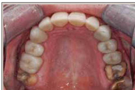
Figure 11: The four molars were prepared for porcelain restorations after the 20 anterior units were inserted.