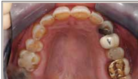
Figure 3: As a result of the widespread occlusal wear, significant dentin was exposed.