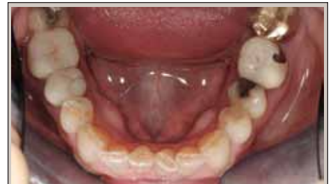
Figure 4: The cupping pattern of attrition on the exposed dentin of the lower incisors indicated an acid erosion problem, rather than a parafunctional grinding issue.