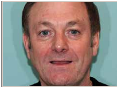
Figure 1: A 56-year-old male patient presented because his wife noticed his teeth were "disappearing."

A study of old photographs spanning 25 years suggested that a loss of vertical