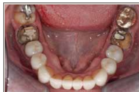
Figure 12: The lower molars were prepared for full-coverage crowns at the same appointment as the uppers.