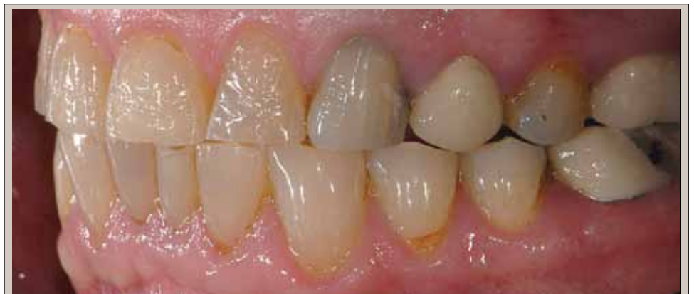
Figure 7: The absence of any specific cusp-to-fossae contacts as a result of the worn dentition made it difficult for the patient to efficiently find a "home" or maximum intercuspal position during function.