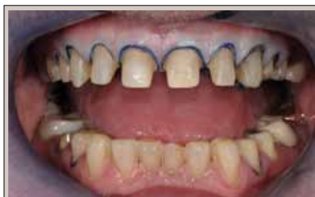
Figure 9: In a single visit, 20 teeth were prepared, and the upper and lower provisionals established a new vertical dimension of occlusion.

However, when preparing upper and lower arches at the same time, it is important not to lose the CR position created in the wax-up. Therefore, a careful process of “cross mounting” was utilized, which required specific details to be captured with